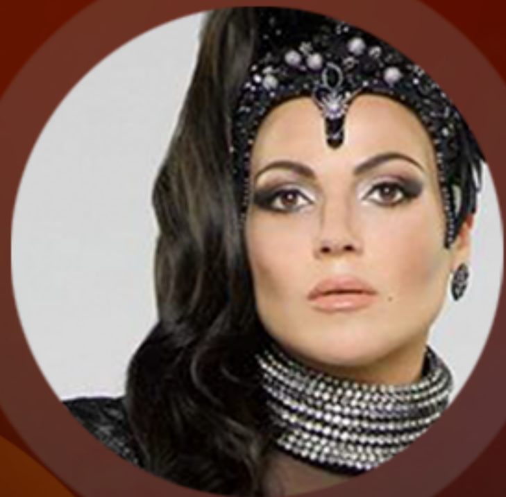
LANA PARILLA AMERICAN ACTRESS, EVIL QUEEN REGINA