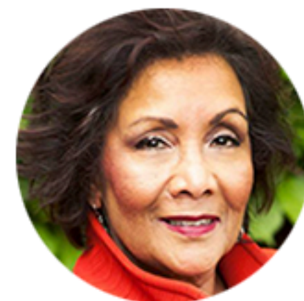
HON. HEDY FRY MP, RIDING OF VANCOUVER CENTRE