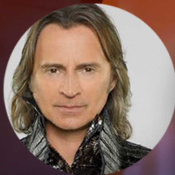
ROBERT CARLYLE SCOTTISH ACTOR, RUMPLESTILTSKIN